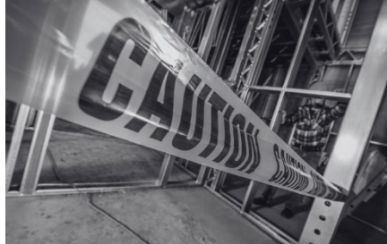
The warehouse owned by U-Chem Innovations, which has been closed since 2018, is now under investigation for improper storage of hazardous materials.

In a shocking turn of events, U-Chem Innovations, a prominent chemical manufacturing company, is now under intense scrutiny as the possible source of the environmental problems. The company, once heralded for its innovation and contributions to the local economy, now finds itself at the center of a brewing crisis that threatens both its reputation and the well-being of the surrounding community.