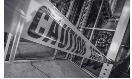
The warehouse owned by U-Chem Innovations, which has been closed since 2018, is now under investigation for improper storage of hazardous materials.

Citizens have attended town council meetings to report what they've seen, reached out to elected officials, and even organized a group called Midtown Concerned Citizens (MCC). Their complaints seem to have fallen upon deaf ears at the local level, however, as their concerns have been met with unreturned phone calls, silence from town officials, and months of inaction.